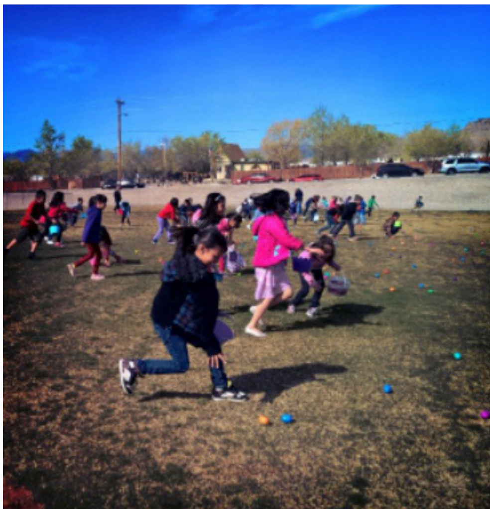
Children from West Wendover scramble to fill their baskets with Easter eggs.

On April 4th, hundreds of children from West Wendover participated in the Annual Easter Egg Hunt. Newmont once again donated to the fun event!