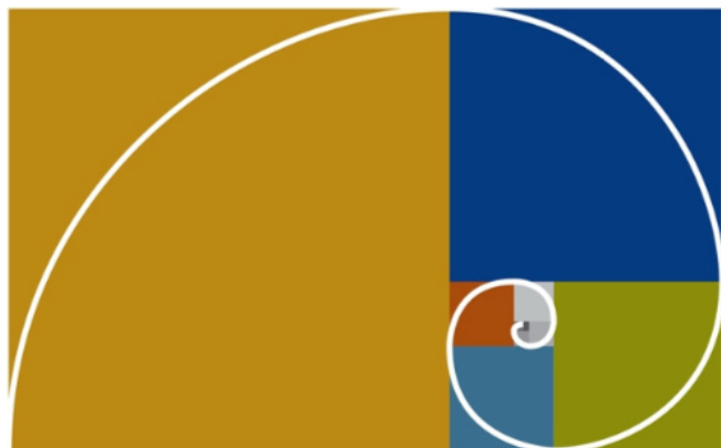
The Newmont Safety Journey