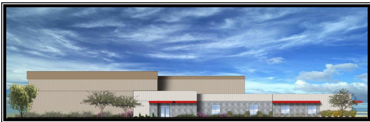
Proposed Recreation Center

The proposed Recreation Center is planned to be a 27,000 square foot multi-purpose facility located adjacent to the Aquatic Facility will greatly reduce the boredom that many people talked about. It is proposed to contain: a full sized gymnasium with stage, a racquetball court, weight and cardio workout room, a walking and jogging track, game room, dance studio, multi-purpose rooms, kitchen, offices, restroom facilities and storage space. It is anticipated that construction will take 16 months to complete.